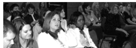
Onlookers at the College Bowl.