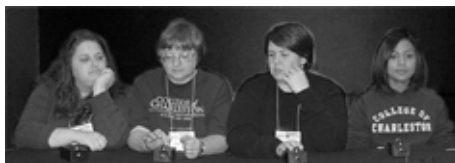
Team College of Charleston buzz in an answer at the College Bowl.